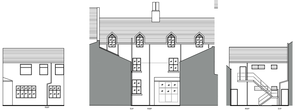
ELEVATION, COURTYARD 2, a SCALE 1:100