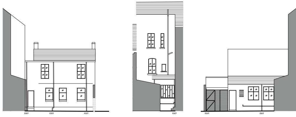
ELEVATION, COURTYARD 1, a SCALE 1:100